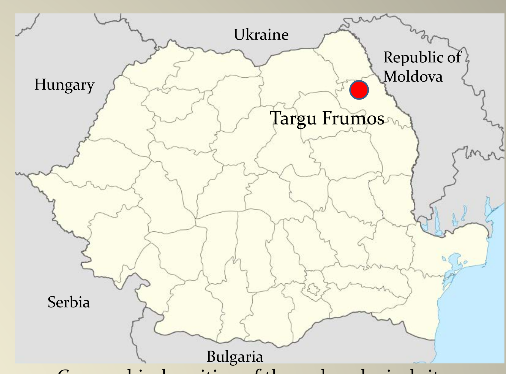
Geographical position of the archaeological site.

The Chalcolithic site of Targu Frumos (Iasi County, Romania) represents the most extensive settlement of Precucuteni culture, on the territory of Romania. The site comprises three levels of housing, summing up about 80 cm of sediments (4800-4600/4500 BC) (Ursulescu et al., 2005). The settlement was established between the Passage of the Siret River and the Moldavian Plain; it is possible that this location made it a rich habitat for wild animals, particularly for wild boar (Sus scrofa ferus).